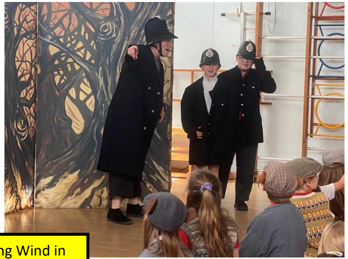
Everyone enjoying Wind in the Willows!