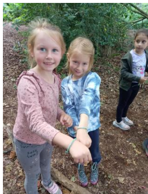
Year 2 woods in the sunshine!