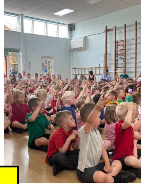
Our rockin' assembly on Monday!