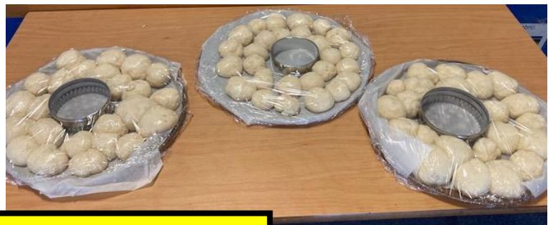
Year 3 Garlic doughballs!