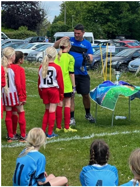
Girls football – runners up in the final!