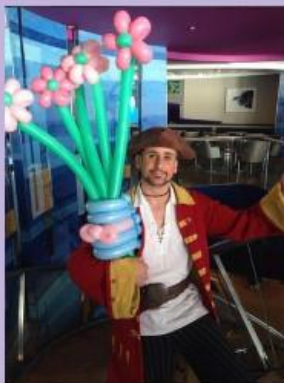
The Prebendal School