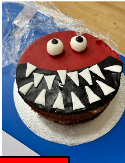
More red nose day fun!