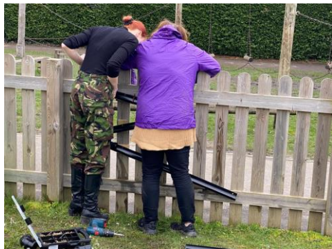
Developing the quad area!