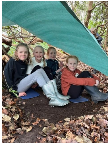
Fun at the woods with Year 5!