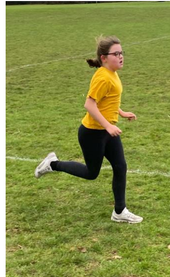
Cross country runners at MRC