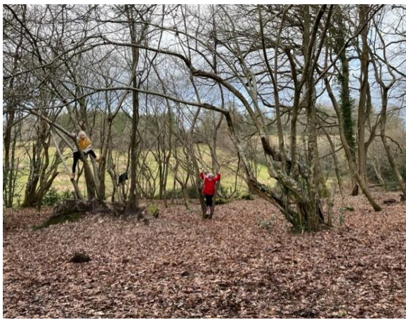
Forest school fun!